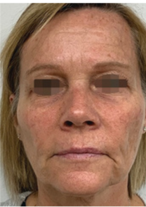
After 2 txs