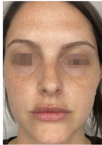
After 1 tx