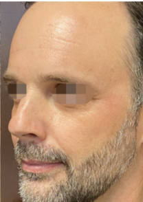
After 3 txs